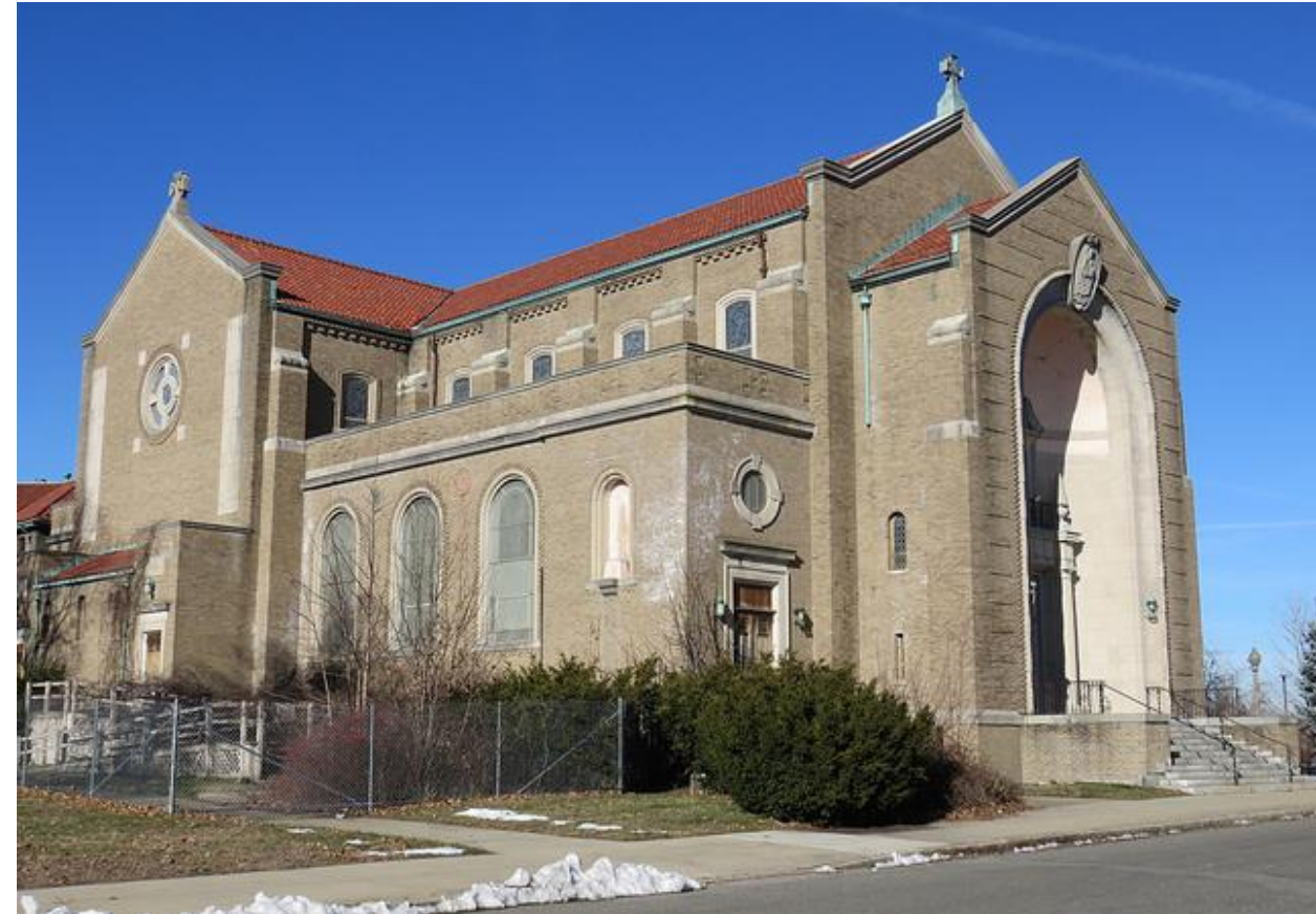
St. Gariel's Church (1929) Designed by Maginnis and Walsh, an architectural firm nationally known as designers of Roman Catholic churches and institutional buildings