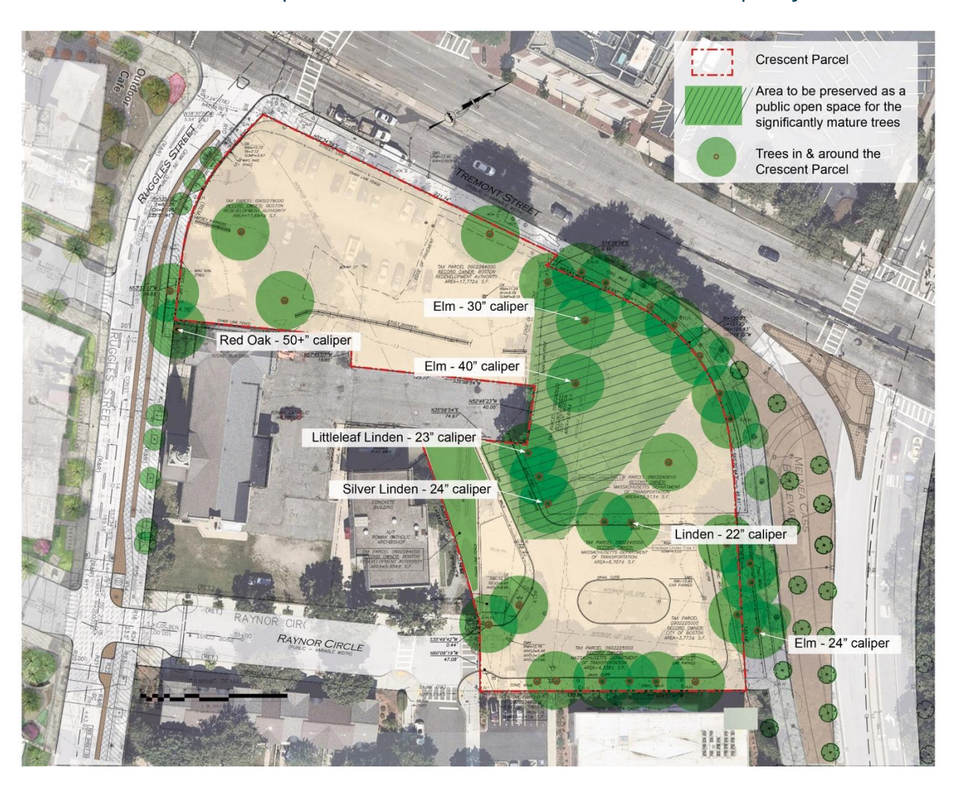
Figure 2 Diagram of trees that must be preserved.