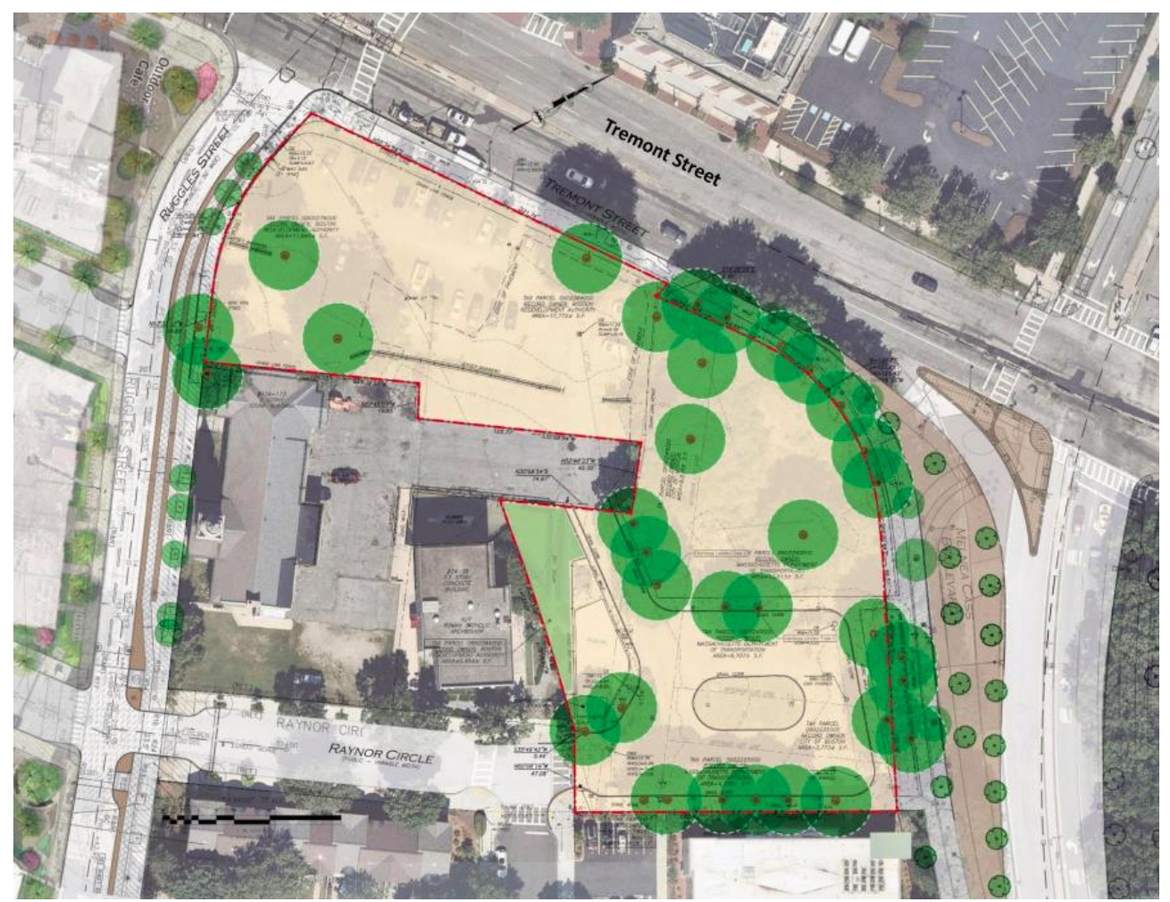
Figure 1. Parcel boundaries and existing trees

Within a half-mile radius there are over 15,000 residents, over 50% of whom are under the age of thirty-five. The site has access to major thoroughfares and public transit.