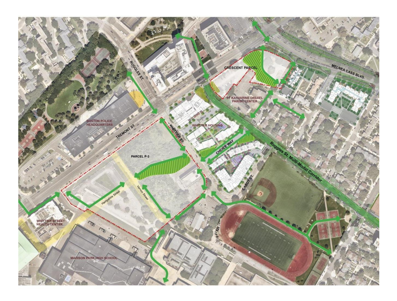
Figure 4. Potential open space network along Tremont Street