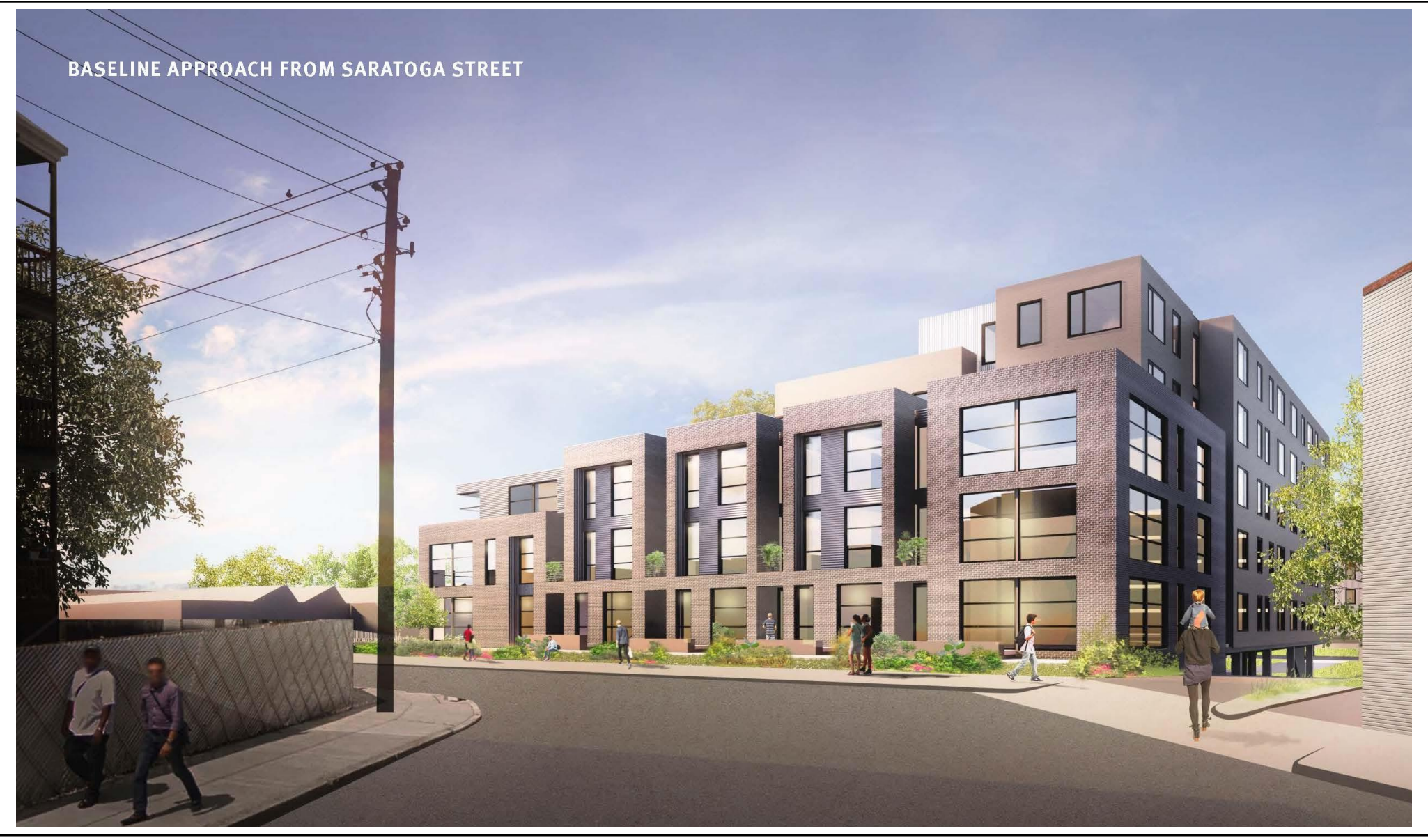
Figure 8 Previous Submission: 250 Units Perspective