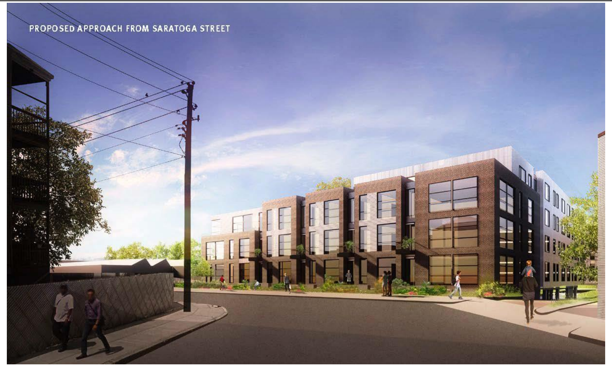
Figure 9 Proposed Change: 230 Units Perspective