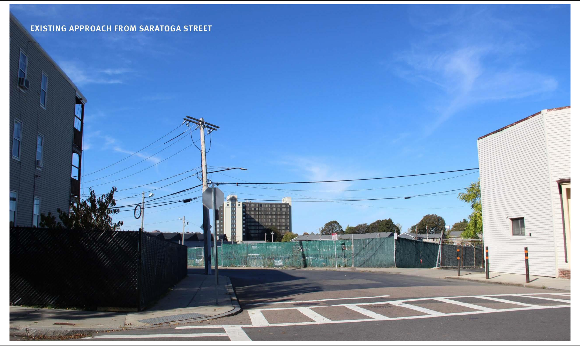
Figure 7 East Boston, Massachusetts Figure 7 Existing Approach from Saratoga Street