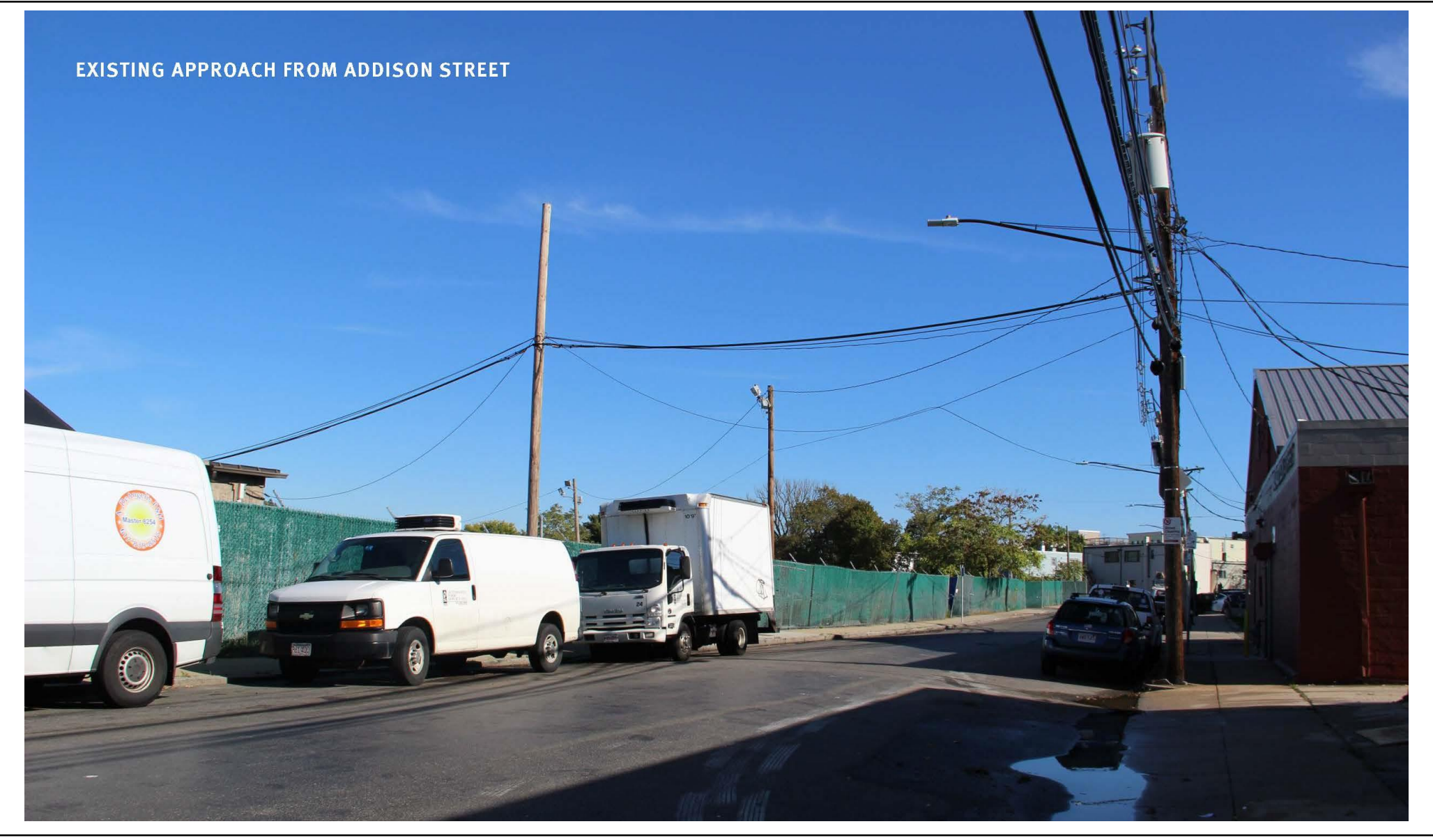
Figure 4 East Boston, Massachusetts Existing Approach from Addison Street