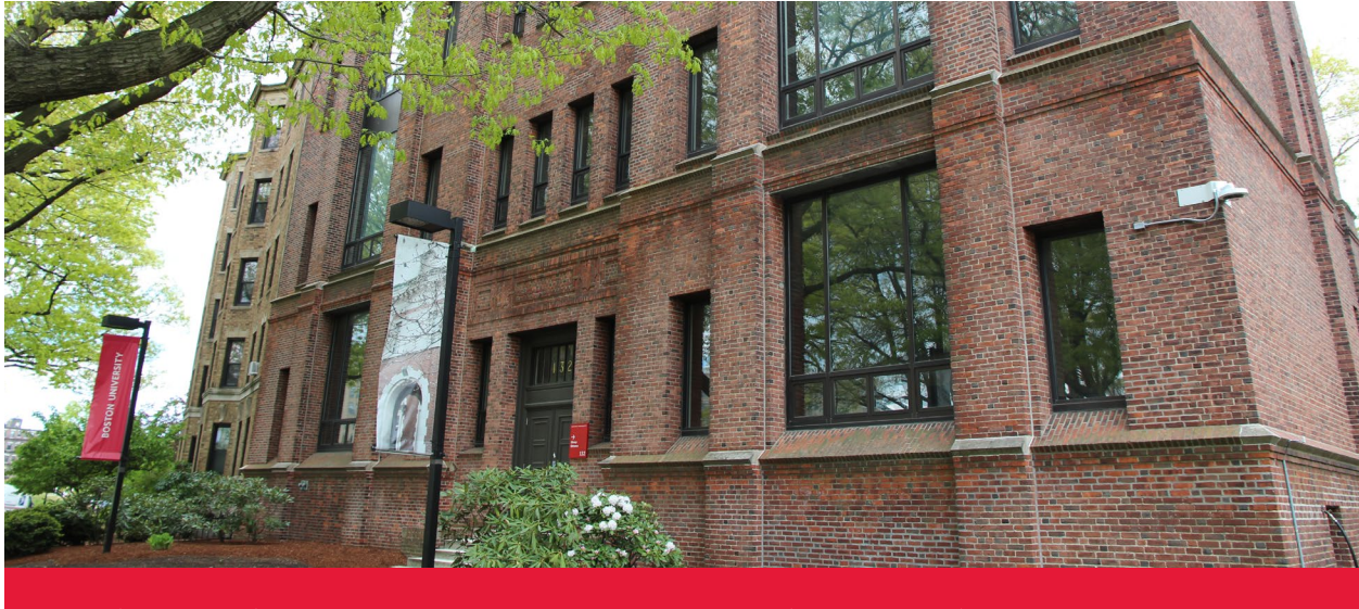
Update on the Fenway Campus Institutional Master Plan