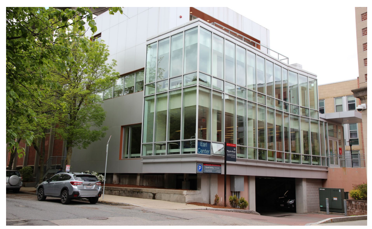
The Earl Center for Learning and Innovation within the Activities Building provides an intellectual and physical space allowing faculty, staff, and students the opportunity to engage in experiential learning programs and workshops.

Several PIPs have progressed, while others have been abandoned or will continue to be analyzed for viability in the longer term. The CCSR building and associated courtyard opened in 2009. The East Wing project will continue to be analyzed for its viability in the longer term for the University. The West Wing project evolved to the point that the original project was abandoned in favor of the Riverway House Renovations and New Addition Project, which was completed in August 2009. The most recent project, Earl Center for Learning and Innovation, was completed in April 2013.