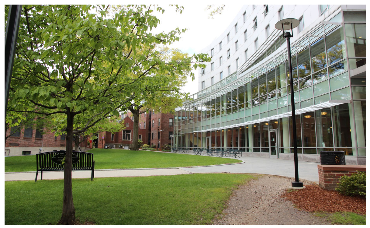
The Campus Center and Student Residence achieved LEED Gold certification. Its courtyard creates a connection through the campus to Pilgrim Road and provides an area for the community to relax and gather.

Boston University endeavors to reduce the University's environmental footprint by effecting change on campus and integrating sustainability into existing programs in education, research, and operations. Boston University's Sustainability Office, sustainability@BU, was established in 2009 in order to reduce the University's environmental footprint by integrating sustainability into existing programs, facilities, and operations. As the campus changes, Boston University strives to focus on conserving energy and decreasing greenhouse gas emissions throughout all University buildings and operations.