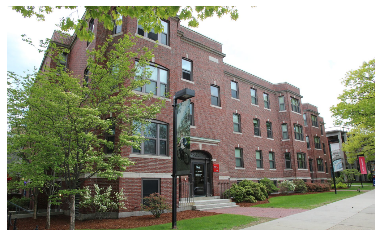
Riverway House Residence Hall provides housing for undergraduate students.

The Fenway Campus facilities continue to have the same programmed uses as prior to the merger.