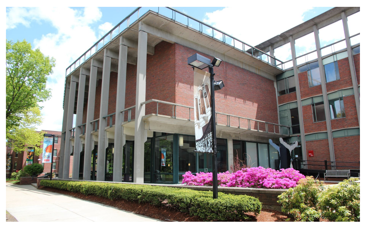
The 623-seat Wheelock Theatre offers live theater shows, theater classes, and workshops.