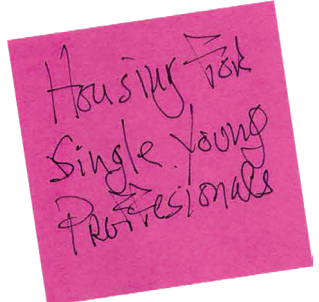
"Housing for single young professionals