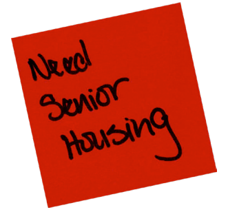
"Need senior housing"