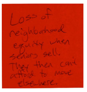
"Loss of neighborhood equity when seniors sell. They then cannot afford to move elsewhere."

What do you think is essential for this household type? Consider location, community space, privacy, transit access, etc.