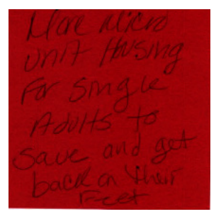
"More micro unit housing for single adults to save and get back on their feet"

What do you think is essential for this household type? Consider location, community space, privacy, transit access, etc.