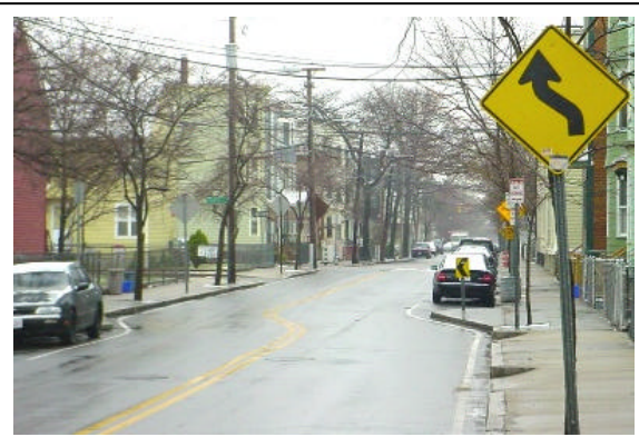
Changing on-street parking from one side of the street to the other can help reduce excessive speeds on straight residential streets. (Photo: Columbia Street in Cambridge).

In addition to the issues mentioned above, general improvements include: roadway resurfacing, new sidewalks, new street lighting, and repainting lane markings and crosswalks. In order to make the road more pedestrian friendly, on-street parking could alternate between different sides of street. Neckdowns should be added at intersections and where parking lanes begin and end. The neckdowns could be landscaped, possibly with trees, if subsurface conditions permit. Speed humps should be considered to slow traffic in front of the BHA elderly and disabled housing at 125 Amory. Sidewalks should be widened where they are below the 5 ft. minimum standard and should have clear space of at least 4 ft. to permit wheelchair access. New development should minimize the number of driveway curbcuts intruding on sidewalks. Atherton Street between Amory and Lamartine Street should be returned to two-way operation as it was before 1987.