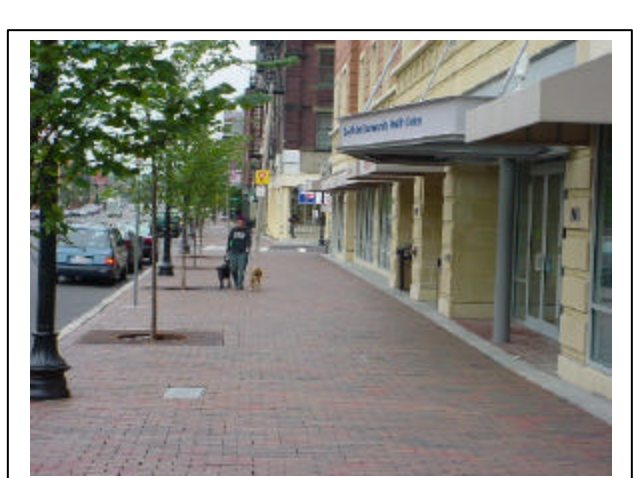
Street trees create a buffer between the walking zone and the roadway.