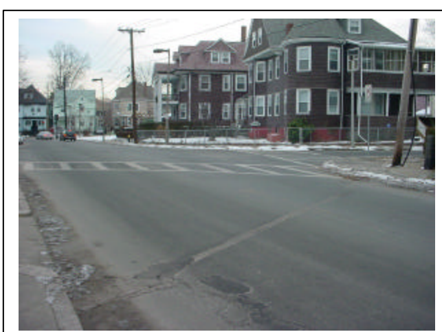
Amory Street looking north towards School Street and Marbury Terrace. Note faded double yellow line. The recently marked diagonal crosswalk lengthens the crossing distance. There are no wheelchair ramps.

Atherton Street runs one-way westbound and has one wide lane and meets Amory Street at a signalized intersection. (The one-way restriction between Amory and Lamartine went into effect on July 1, 1987.) Atherton is the only street between Centre and Boylston that crosses over the Southwest Corridor and railroad tracks to Lamartine Street. As a result, it gets a significant amount of traffic. Cars parked too close to the intersection on Atherton make the left turn from Amory northbound on to Atherton westbound difficult at times. The loop detectors on Atherton do not detect bicycles. There is a BHA elderly housing project at 125 Amory; residents of this project have difficulty crossing Amory Street. There is a handicapped vehicle parking area directly in front of the building with a wheelchair ramp. The nearest crosswalk is at Bragdon Street.