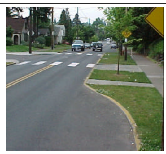
Curb extension with trees and landscaping.

Although the lane markings have faded, Centre Street westbound approaching Lamartine Street is designed to be two lanes, a left turn lane and a straight through lane. In practice, because of illegal parking, it typically functions as a single left or straight lane. If the drop-off area is moved in front of the station, the center line could be shifted over to accommodate two travel lanes (left only and straight only) and a parking lane westbound. The loop detector in left lane should be adjusted to be sensitive to bicycles, and the sensitive location should be marked. New signal and controller equipment is also needed. The intersection geometry should be studied to facilitate the left turn on to Lamartine and to improve the alignment of the bike path crossing. A diagonal bike crossing should be used to have