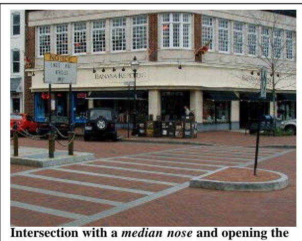
full width of the crosswalk.

The signal equipment at this intersection is old and does not have the functionality required. New signal hardware and a new controller are needed. Currently the signal is timed so that pedestrians crossing lawfully must wait in the median for up to two minutes before they are permitted to finish crossing. The pedestrian signal timing should be adjusted to minimize pedestrian delay. Concurrent pedestrian green with a leading pedestrian interval should be used and the walk signal should be automatic (no push button).