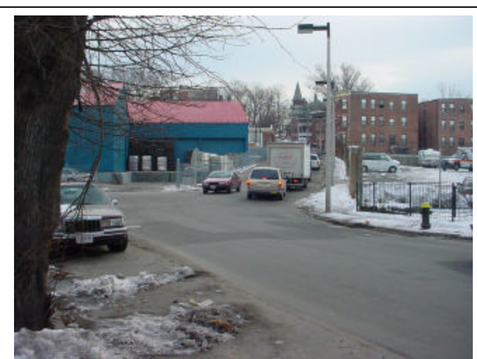
The Amory Street and Dimock Street Intersection. The red car facing the camera has a stop sign. There are no visible pavement markings. The intersection is difficult for pedestrians to cross safely.

The Amory Street and Dimock Street intersection is Y-shaped and unsignalized. There is a stop sign facing drivers on Dimock Street entering Amory. There are no marked crosswalks. There is a very large amount of paved area. The sight lines are poor for drivers on Dimock approaching Amory.