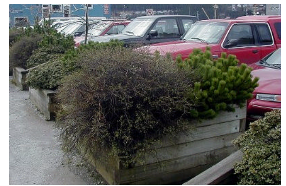
Landscaping can make parking lots much more attractive.

The JCG planning process clearly calls for creative measures to insure no increased automobile traffic in the area. Therefore fewer spaces per unit should be built, taking into account an inventory of on-street parking (including existing spaces, and planned additional spaces on existing or new streets), the proximity of transit, and the Transportation Demand Management plans that will be required of developers. For residential units new on-street parking within a three minute walk of a residence should be counted to make up a ratio of up to 0.67 spaces per unit. For commercial units, on-street parking within a