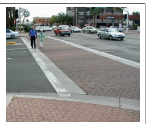
Distinctive paving material can make crosswalks more visible and attractive.

Between Centre/Ritchie and Dimock Street, Columbus Avenue has two lanes in each direction, on-street parking, and a raised median. The exception is the short block between Centre and the Amory Street Connector, where the stretch of the curb lane between the Muffler Mart driveway and Amory St. Connector functions as a right-turn only lane. It should be marked as such. This stretch of roadway is very awkward for bicyclists, especially heading southbound. There is not enough room in the right lane for a motorist to pass a bicyclist who is keeping a safe distance from parked cars and their opening doors. Because it is uphill in that direction, bicyclists may be traveling at only 10 mph or less. At a minimum, Share the Road signs