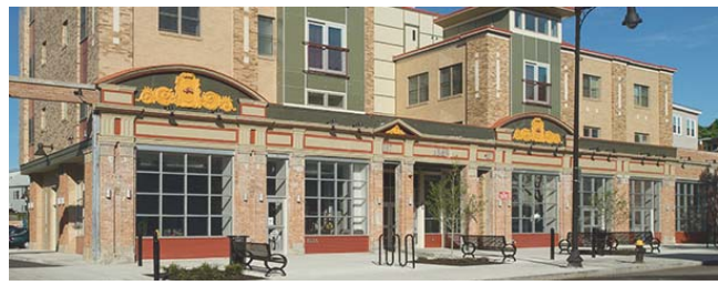
Four Corners Main Street District

The community vision was created through a community planning and visioning process that included a community workshop, community open house, and a series of eight meetings with a Mayoral appointed Working Advisory Group (WAG), many in-person visits to each Station Area neighborhood, stakeholder, resident and advocate interviews and an analysis of the existing conditions of the Station Area. The Vision Statement sets a direction for future efforts in the Four Corners/Geneva Avenue Station Area. The Community Goals add more detail to the statement.