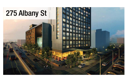
Developer: Normandy Realty