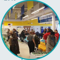
Envisioning Your Neighborhood 12/10