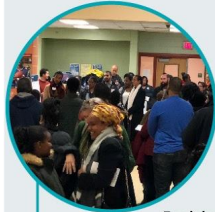
Open House 10/25