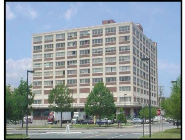
12 Channel St Building