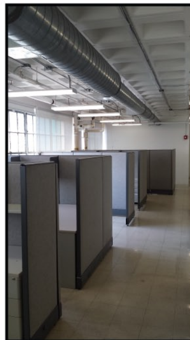
Interior View, Suite 601