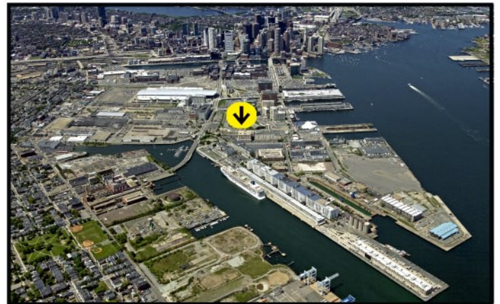
Boston Marine Industrial Park

For additional information or to schedule a tour, please contact: