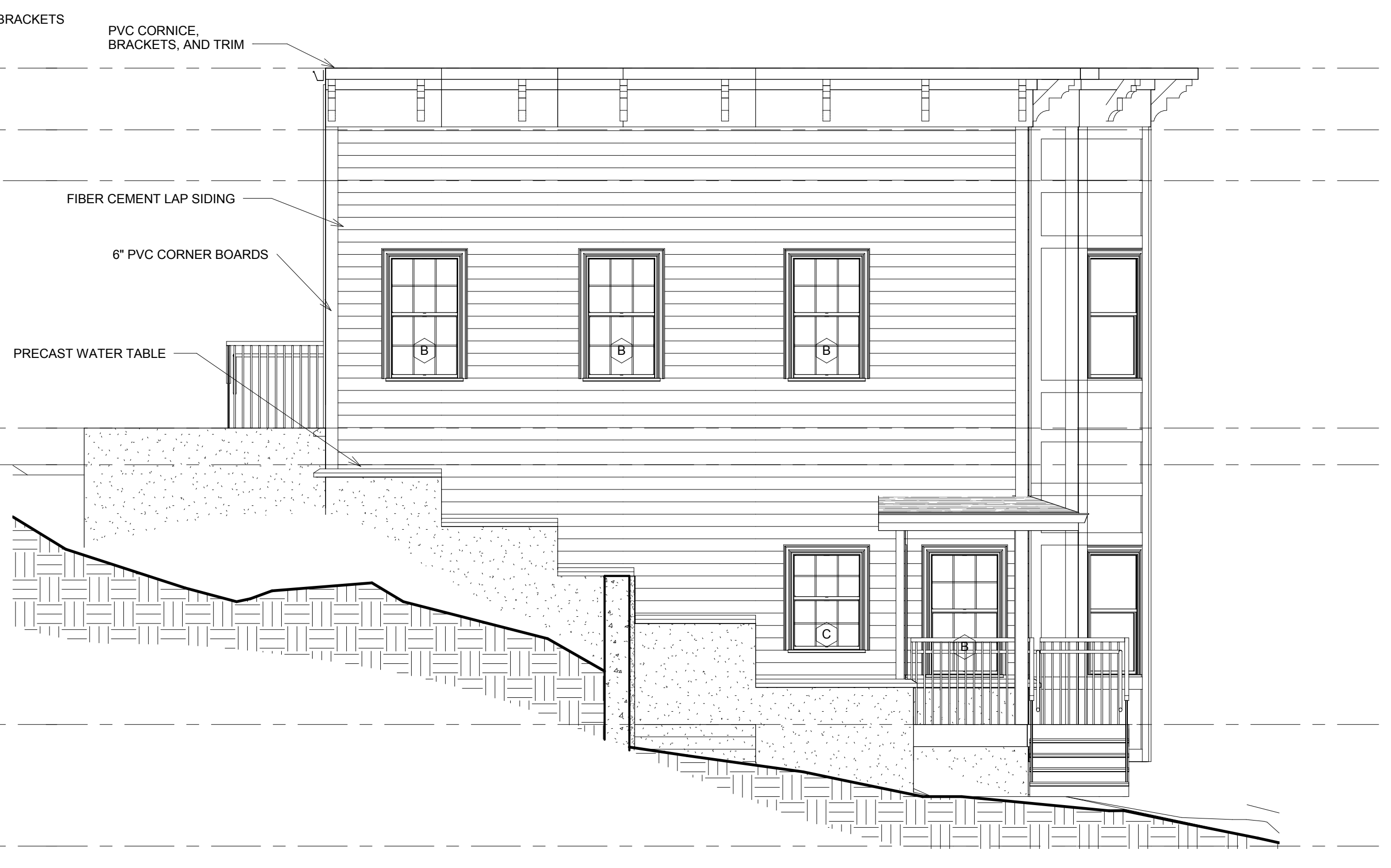
② SOUTH ELEVATION 1/4" = 1'-0"