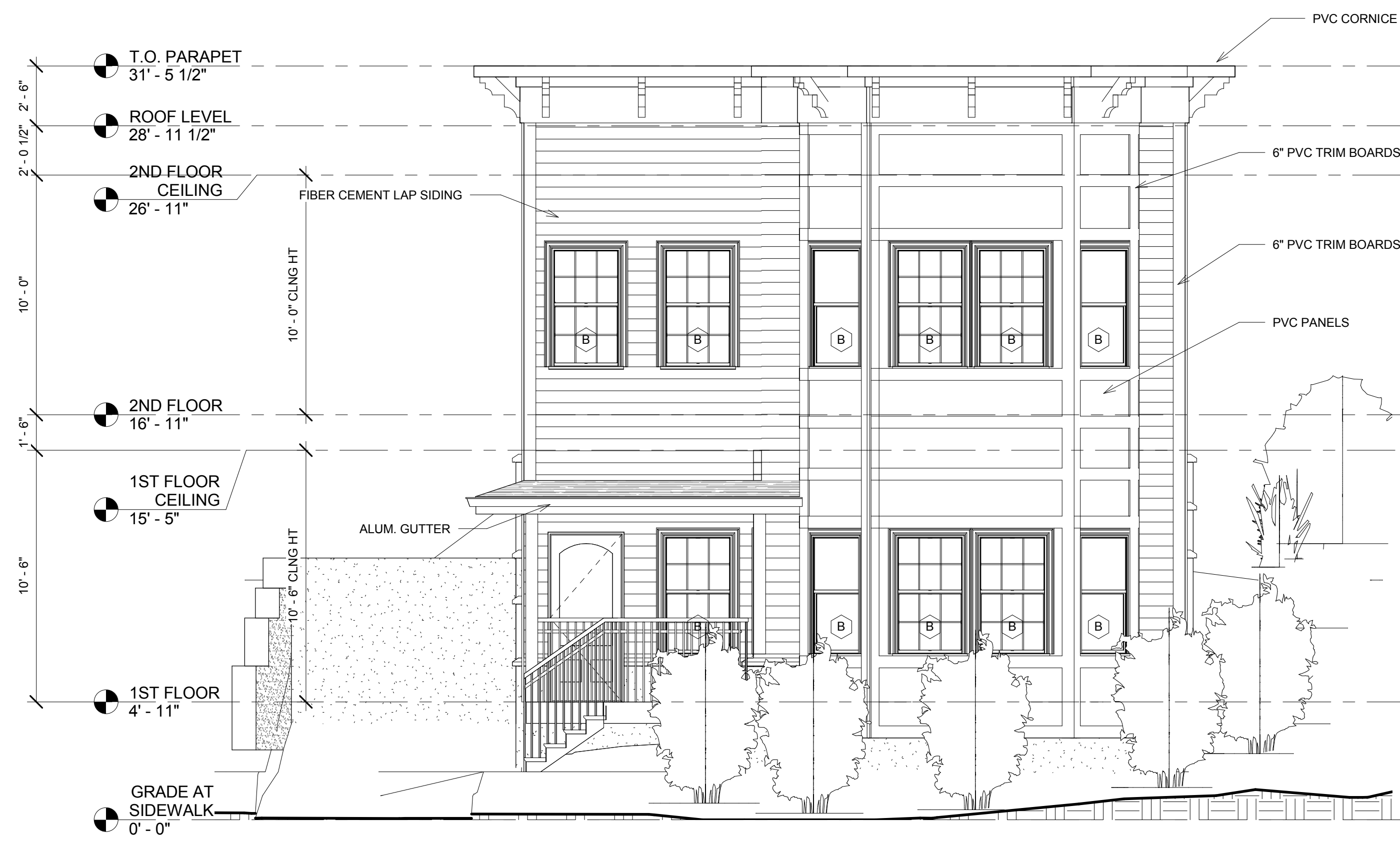
① EAST / FORBES STREET ELEVATION 1/4" = 1'-0"