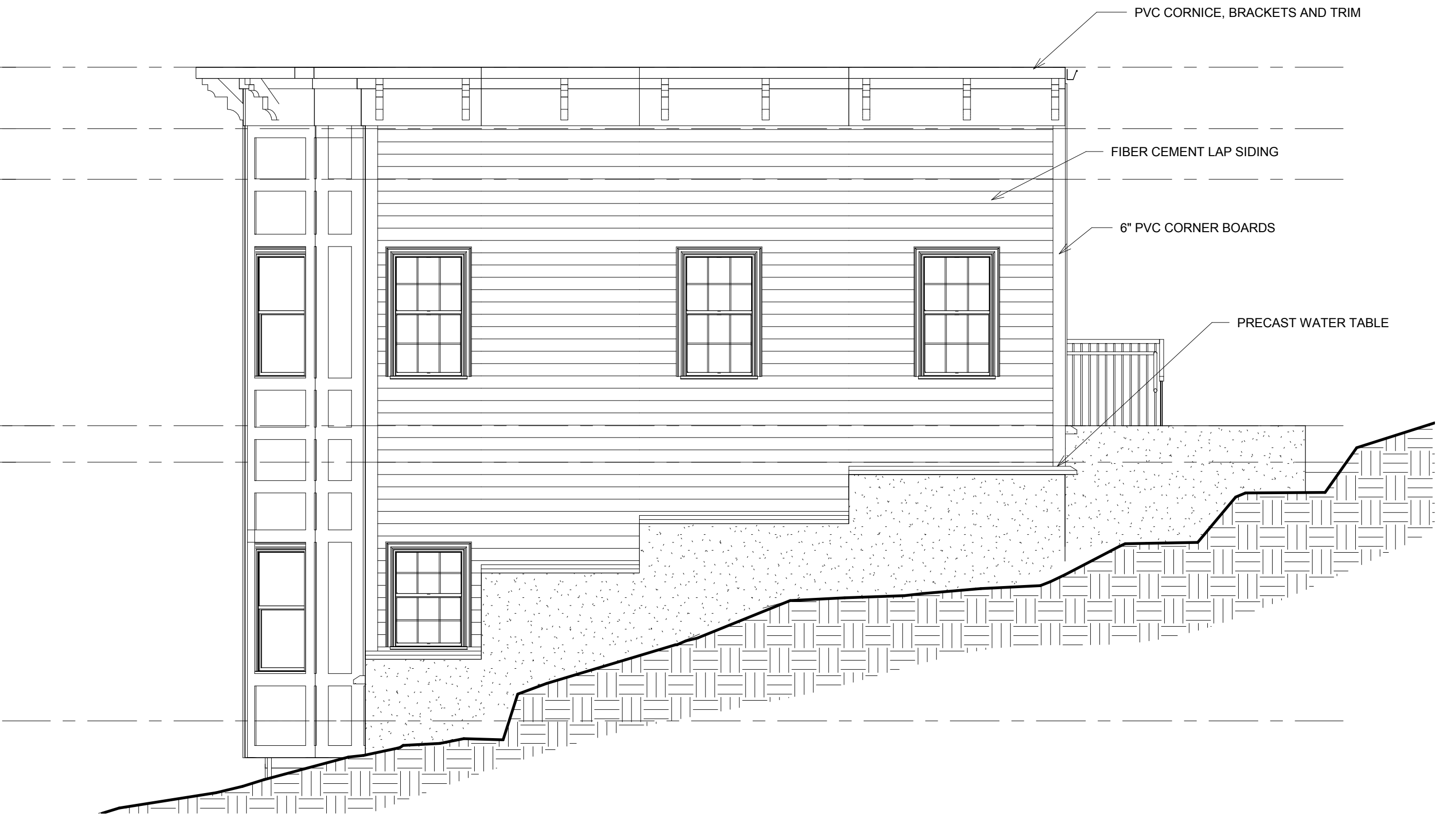
③ NORTH ELEVATION 1/4" = 1'-0"

Location PROPOSED SINGLE FAMILY HOME 87 FORBES STREET JAMAICA PLAINS, MA