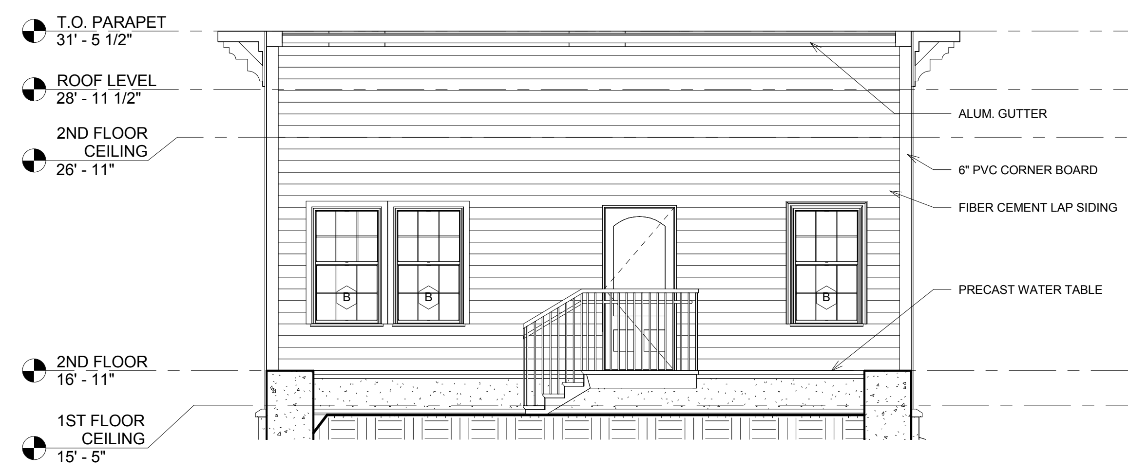
④ WEST/REAR ELEVATION 1/4" = 1'-0"