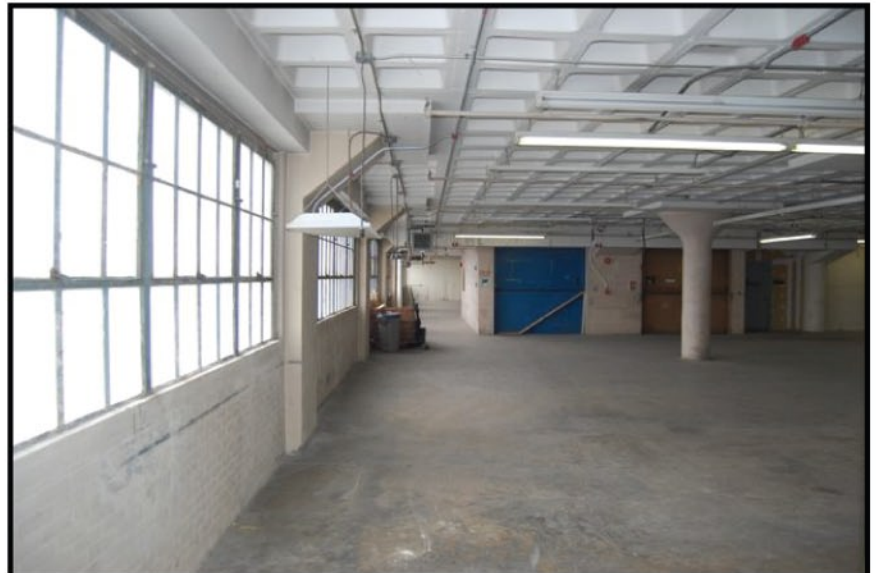
Interior View, Suite 701