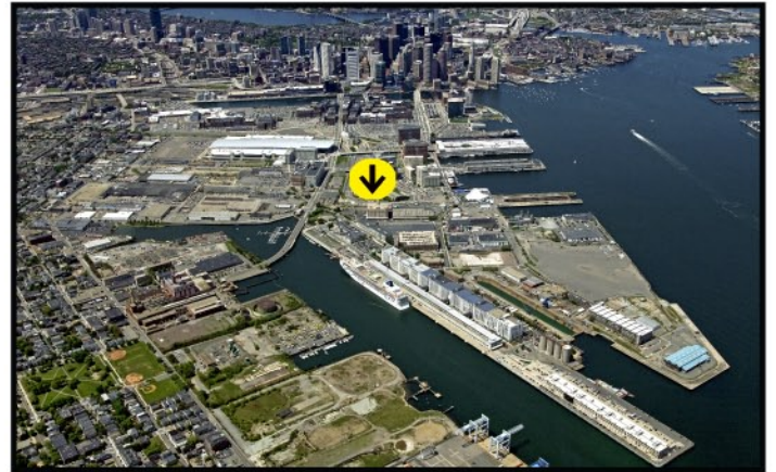
Boston Marine Industrial Park

For additional information or to schedule a tour, please contact: