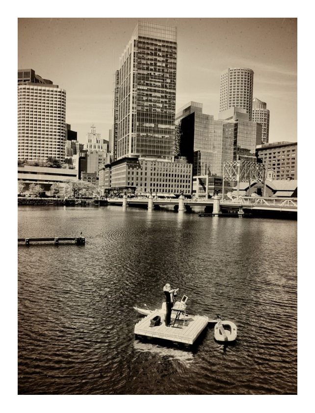
We bring art to the public.