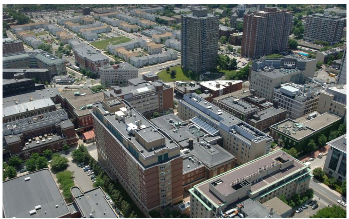
Center of Photo: Main Building Complex. Left to Right: The Fennell/Iorio Building, the White Building, and the Matricaria Building.

The University's main building complex, located at 179 Longwood Avenue, consists of 90,147 square feet of land bounded by Longwood Avenue on the southwest, Palace Road on the southeast, the Boston Latin School on the northeast, and the Brigham and Women's Hospital's Longwood Medical Research Center (LMRC) on the northwest. In 1993, this land was designated as the Massachusetts University of Pharmacy Institutional District, as defined by Article 71 of the Code.