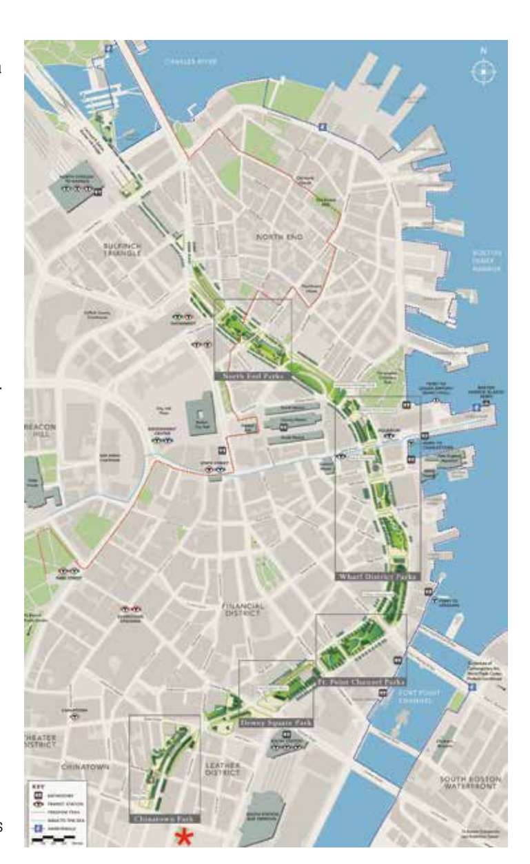
The study area (marked with a red star) is located just south of the final segment of the Greenway. It offers an opportunity to complement this seminal city-making effort through its open-space, neighborhood identity strategies.

The study area sits at what can be interpreted as an unfinished end of Boston's Big Dig. It occasionally offers the perception of being a leftover of this world-class work of urban infrastructure. Since its completion, the Rose Kennedy Greenway offers a world-scale axis that could be punctuated in the study area. The current terminations are focused on solving traffic problems.