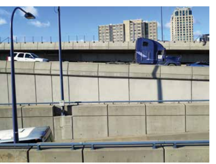
The site presents a complex and very challenging range of ramped vehicular flows at very different levels.

Costs of decking and the associated use of air rights are prohibitively expensive given current and projected market conditions. Based on interviews with MassDOT and the BRA and independent research, decking over parcels 27, 28, 29, 30, and 31 will increase costs in the range of 25 to 50 percent (see table below for more details). Therefore, the development program recommended in the 2004 South Bay Planning Study is not feasible. However, opportunities exist to use the parcels on interim and long-term bases to create value within the study area's master plan.