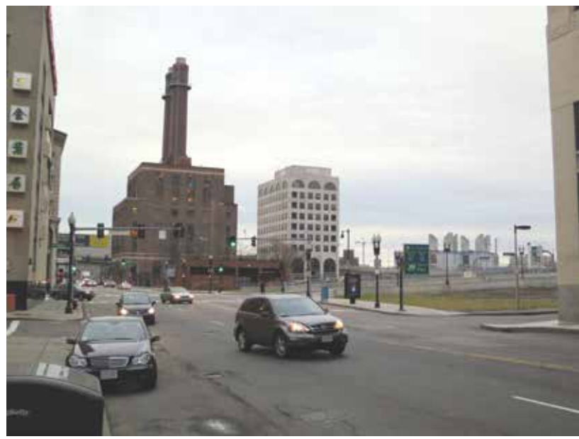
The Kneeland Street corridor (top) with its existing fabric and density offers opportunities to reintegrate the study area (above) into the fabric of the neighborhoods.