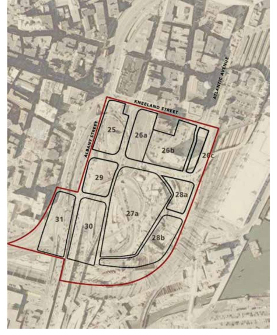
Summary of Recommendations

The panel focused on several physical, institutional, and organizational improvements that would help the city move forward with a redevelopment strategy. These recommendations include the following: