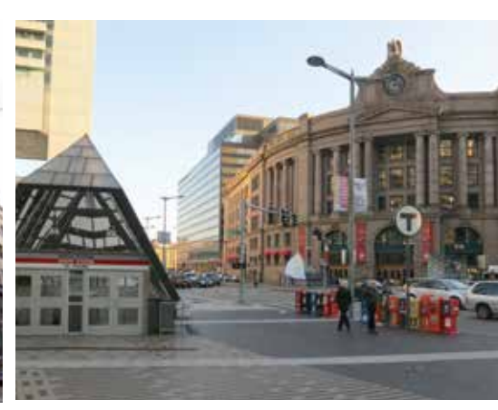
Left: A celebration at Chinatown Park, the open space of the Greenway just north of the South Bay study area. Center: Typical urban fabric in the Leather District. Right: South Station connects the site with regional and public transportation networks tied to the new infrastructure of downtown.