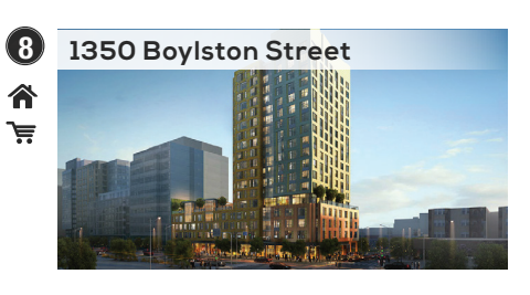
201,850 SF, 230 residential units, 7,050 SF retail. Developer: Skanska Commercial Development LLC