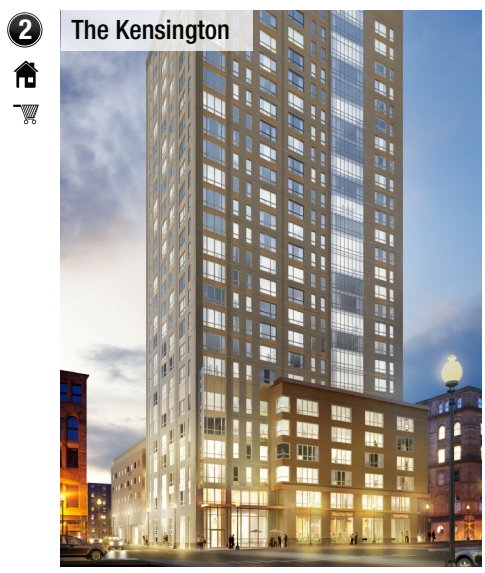
$170M, 345,000 SF, 27 stories, 381 residential units, 4,000 SF of ground floor retail.