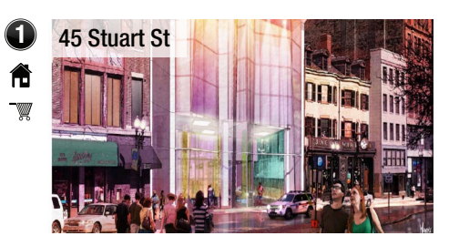
$125M, 384,000 SF, 29 stories, 404 residential units