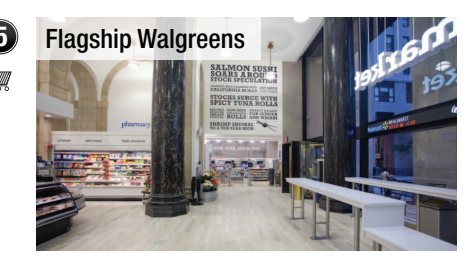
24,000 SF flagship store, 3rd luxury store in the nation features a salon, food market and fitness center. Available 2nd floor retail 16,500 SF. www.cbre-gra.com